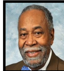
Sen. Gerald Neal (D) - Louisville Minority Floor Leader